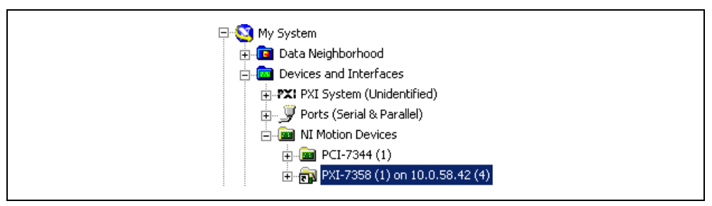
Figure 2. Mapped Remote NI 73xx Controller

Using NI 73xx motion controllers with the LabVIEW Real-Time Module and a remote PXI system is very similar to using NI-Motion with an NI PCI-73xx motion controller in the host machine. The only difference is that you must map the remote PXI system to the local machine in MAX before you configure and initialize the motion system. Figure 2 shows a remote NI 73xx motion controller mapped to the local machine. The IP address in the device name indicates that it is a remote device.