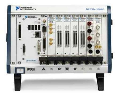
Figure 1. This NI PXIe-8130 controls an 8-slot PXI Express modular instrument and data acquisition system.

The NI PXIe-8130 features an NVIDIA MCP55 Pro chipset. This chipset provides four x4 ("by four") PCI Express lanes that are forwarded to the PXI chassis backplane to create four x4 PXI Express slots. Each of these slots has up to 1 GB/s of dedicated bandwidth with the overall system bandwidth of up to 4 GB/s.