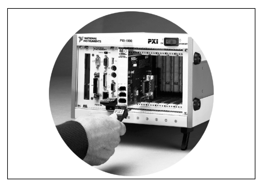
Figure 1. Seating the PXI-8252 Card