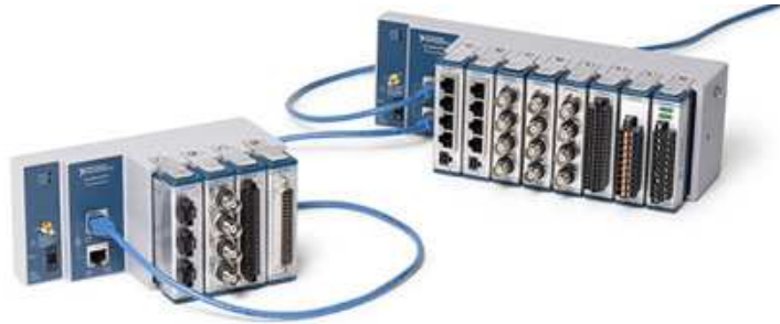
Figure 1. Easily expand your system with an integrated network switch for simple daisy chaining.

CompactDAQ is a modular system, so you can add more measurement types and channels to the system by simply plugging in additional modules. All modules are automatically detected and synchronized to the clock in the backplane of the chassis. CompactDAQ has multiple timing engines that you can use to run multiple hardware-timed operations simultaneously with independent rates for analog input. For long-distance, distributed systems, you can use a Time Sensitive Networking (TSN) enabled CompactDAQ device. TSN is the next evolution of the IEEE 802.1 Ethernet standard. It provides sub-microsecond synchronization over a distributed network of DAQ nodes. Precise timestamps and packet-based communication are used to share a common notion of time on all nodes in the network, which allows for accurate synchronization over long distances and eliminates the need for lengthy, physical timing cables.