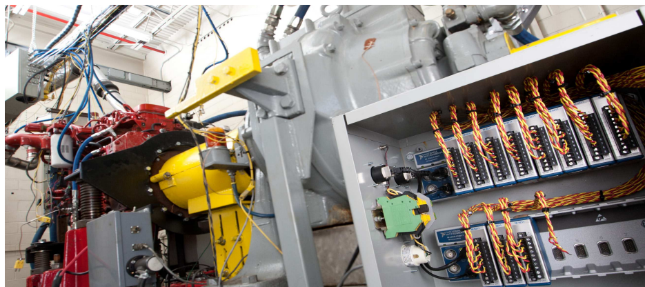
Figure 2. Spend less time preparing instrumentation for the rigors of field testing with an extended temperature range and high shock and vibration resistance.

For applications requiring additional ruggedness, you can extend TSN enabled CompactDAQ systems with FieldDAQ™ devices. These devices are IP65/67 rated to be dust-tight and waterproof. They operate in a -40 °C to 85 °C temperature range with 100 g shock and 10 g vibration. You can synchronize FieldDAQ devices with TSN-enabled CompactDAQ devices within <math><1 \mu\text{s}</math>.